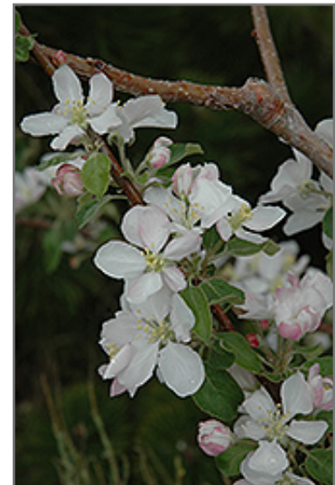
Apple, Pink Lady (Semi-Dwarf) flowers