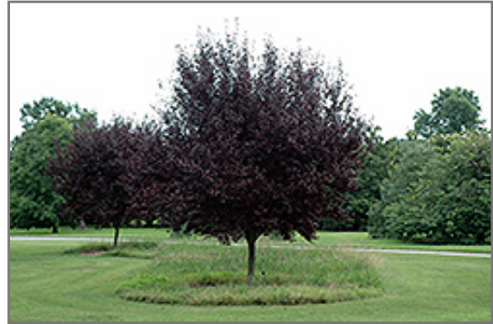
Plum, Krauter Vesuvius (KV)

Plum, Krauter Vesuvius (KV) will grow to be about 20 feet tall at maturity, with a spread of 15 feet. It has a high canopy with a typical clearance of 7 feet from the ground, and is suitable for planting under power lines. As it matures, the lower branches of this tree can be strategically removed to create a high enough canopy to support unobstructed human traffic underneath. It grows at a medium rate, and under ideal conditions can be expected to live for approximately 30 years.