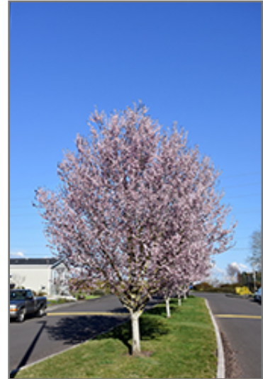
Plum, Krauter Vesuvius (KV) in bloom