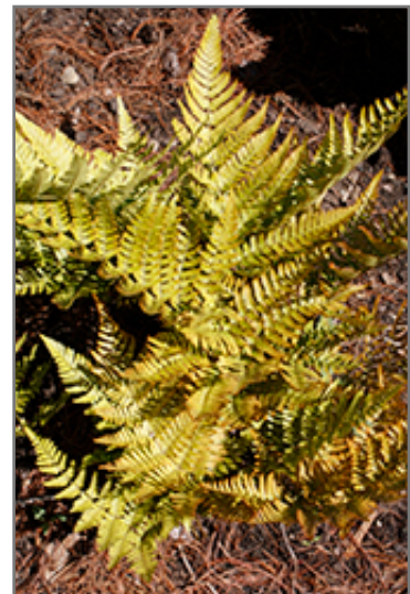
Dryopteris, Brilliance Autumn Fern in fall