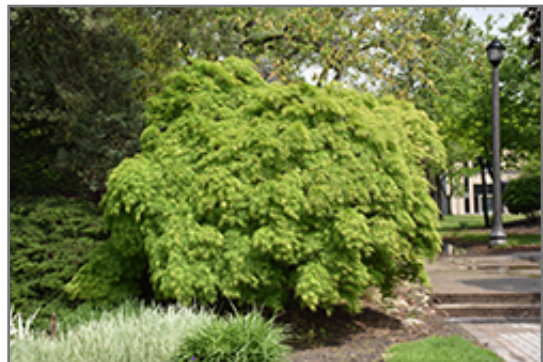
Japanese Maple, Viridis Cutleaf