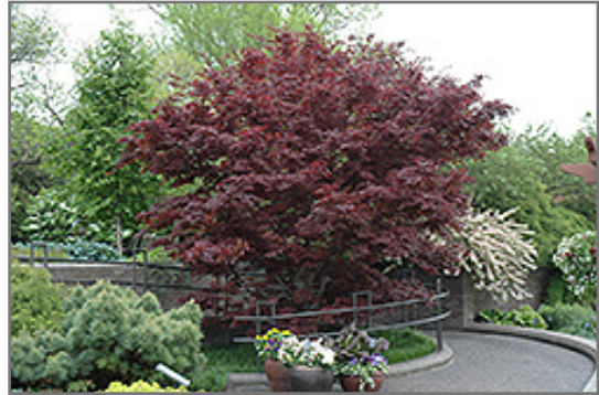
Japanese Maple, Bloodgood