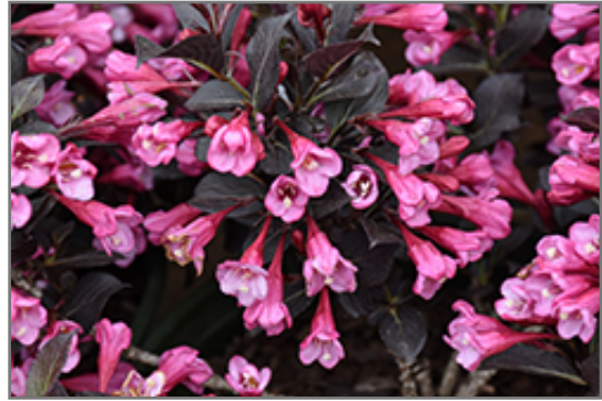
Weigela, Coco Chill flowers

Weigela, Coco Chill is recommended for the following landscape applications;