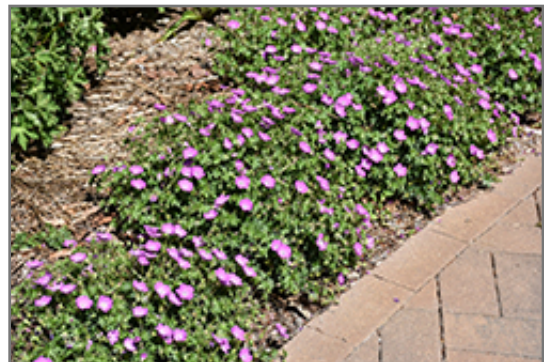
Geranium, Max Frei Cranesbill in bloom