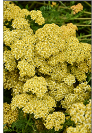
Achillea, Yellow Terracotta Yarrow flowers