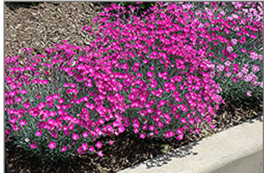
Dianthus, Firewitch Pinks in bloom