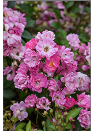
Rose (Shrub), Pretty Polly Pink flowers

Rose (Shrub), Pretty Polly Pink is recommended for the following landscape applications;