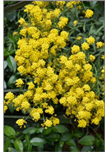
Alyssum, Golden Spring Basket of Gold flowers

Alyssum, Golden Spring Basket of Gold is a fine choice for the garden, but it is also a good selection for planting in outdoor pots and containers. It is often used as a 'filler' in the 'spiller-thriller-filler' container combination, providing a mass of flowers and foliage against which the thriller plants stand out. Note that when growing plants in outdoor containers and baskets, they may require more frequent waterings than they would in the yard or garden.