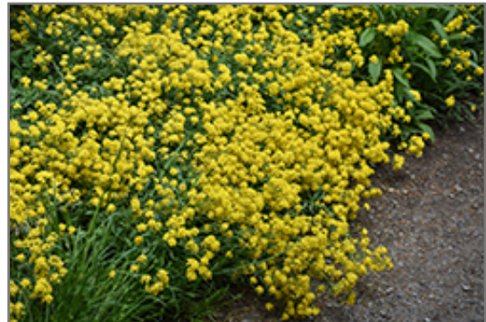
Alyssum, Golden Spring Basket of Gold in bloom