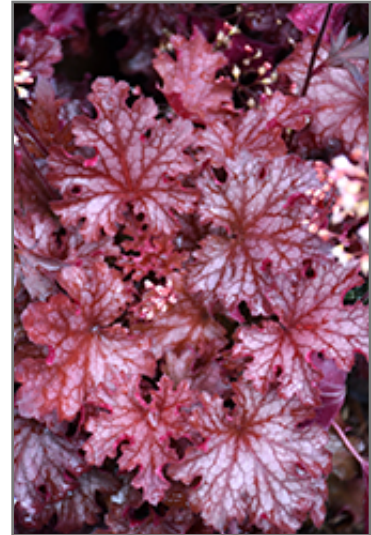
Heuchera, Ruby Tuesday Coral Bells foliage

Heuchera, Ruby Tuesday Coral Bells is a fine choice for the garden, but it is also a good selection for planting in outdoor pots and containers. It is often used as a 'filler' in the 'spiller-thriller-filler' container combination, providing a mass of flowers and foliage against which the larger thriller plants stand out. Note that when growing plants in outdoor containers and baskets, they may require more frequent waterings than they would in the yard or garden.