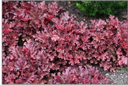
Heuchera, Ruby Tuesday Coral Bells

This is a relatively low maintenance plant, and should be cut back in late fall in preparation for winter. It is a good choice for attracting hummingbirds to your yard. It has no significant negative characteristics.