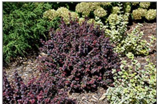
Barberry (Japanese), Sunjoy Todo