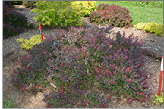
Barberry (Japanese), Sunjoy Todo

Barberry (Japanese), Sunjoy Todo will grow to be about 24 inches tall at maturity, with a spread of 24 inches. It tends to fill out right to the ground and therefore doesn't necessarily require facer plants in front. It grows at a medium rate, and under ideal conditions can be expected to live for approximately 20 years.