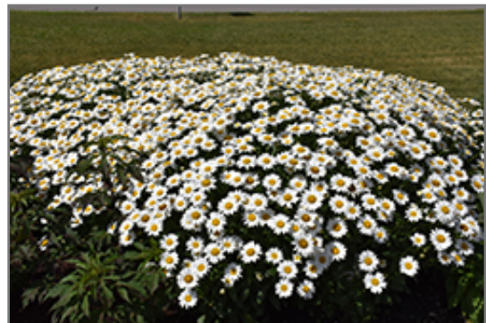
Leucanthemum, Becky Shasta Daisy in bloom