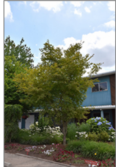
Korean Maple, Northern Glow

Korean maples generally produce a few to no seeds called samaras, which are commonly referred to as helicopters 1/2 to 3/4 of an inch long, and approximately 1/4 inch wide. Growing in pairs, they start green then mature red during the growing season