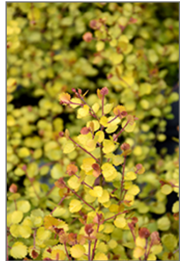
Birch, Dwarf Cesky Gold foliage