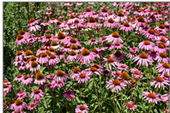
Echinacea, Ruby Star Coneflower flowers