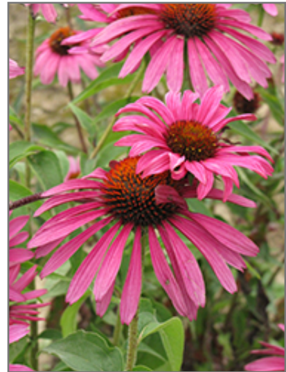
Echinacea, Ruby Star Coneflower flowers

Echinacea or Coneflower will need to be watered during the growing season, in the Lower Columbia Basin there isn't enough rainfall during the growing season. The amount of water and regularity depends on the your soil, the wind and the heat variables at different times.