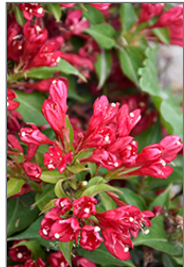
Weigela, Crimson Kisses flowers