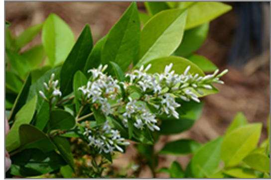
Privet, Golden Ticket flowers

This shrub does best in full sun to partial shade. It prefers to grow in average to moist conditions, and shouldn't be allowed to dry out. This plant should be periodically fertilized throughout the active growing season with a specially-formulated acidic fertilizer. It is not particular as to soil type or pH, and is able to handle environmental salt. It is highly tolerant of urban pollution and will even thrive in inner city environments. This particular variety is an interspecific hybrid.