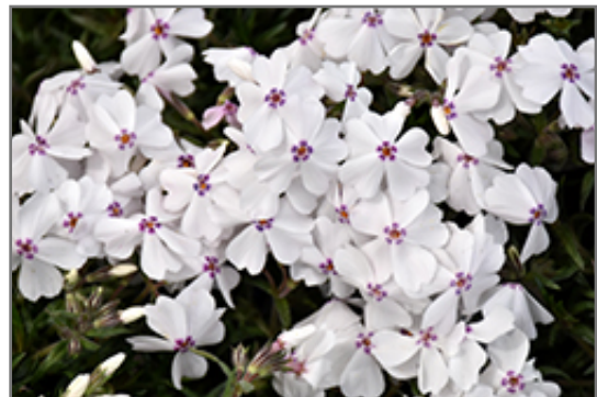
Phlox, (Creeping) Amazing Grace flowers