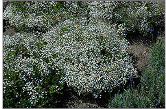
Gypsophila, Summer Sparkles Baby's Breath in bloom

This plant does best in full sun to partial shade. It does best in average conditions that are neither too wet nor too dry, and is very intolerant of standing water. To help this plant achieve its best flowering performance, periodically apply a flower-boosting fertilizer from early spring through into the active growing season. It is not particular as to soil type, but has a definite preference for alkaline soils, and is able to handle environmental salt. It is highly tolerant of urban pollution and will even thrive in inner city environments. This is a selected variety of a species not originally from North America.