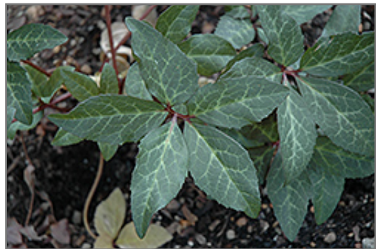
Helleborus, Merlin Winter Rose foliage