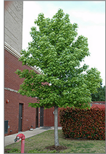
Sweetgum, Happidaze

This tree should only be grown in full sunlight. It prefers to grow in average to moist conditions, and shouldn't be allowed to dry out. This plant should be periodically fertilized throughout the active growing season with a specially-formulated acidic fertilizer. It is very fussy about its soil conditions and must have rich, acidic soils to ensure success, and is subject to chlorosis (yellowing) of the foliage in alkaline soils. It is somewhat tolerant of urban pollution. This is a selection of a native North American species.