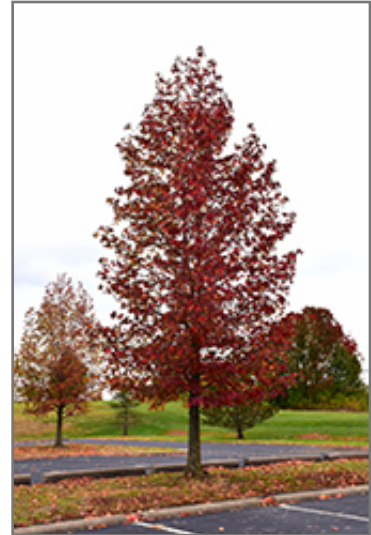
Sweetgum, Happidaze in fall