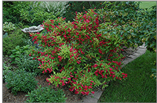
Weigela, Red Prince in bloom