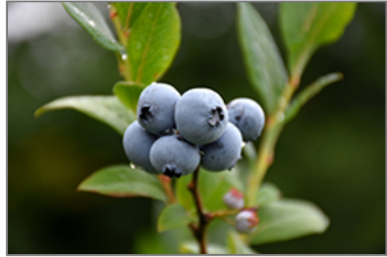
Blueberry, Northsky fruit

Blueberry, Northsky features dainty clusters of white bell-shaped flowers with shell pink overtones hanging below the branches in mid spring. It has green deciduous foliage. The glossy oval leaves turn an outstanding scarlet in the fall. It features an abundance of magnificent blue berries in mid summer.