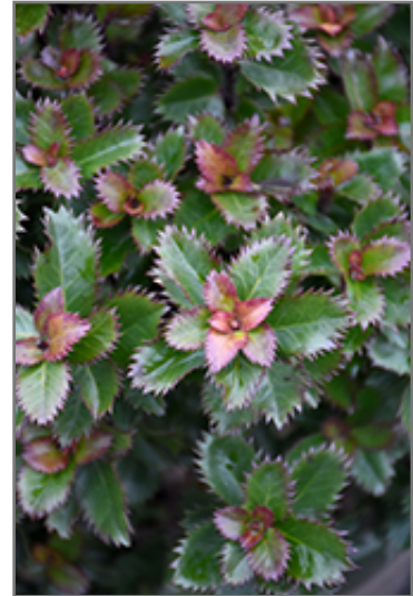
Holly, Scallywag foliage