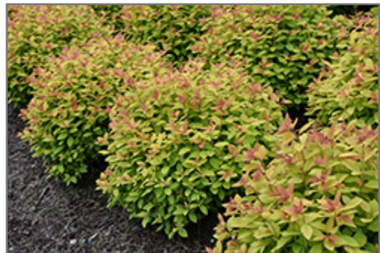
Spiraea, Double Play Big Bang