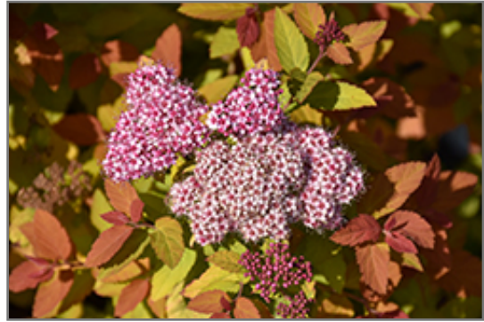
Spiraea, Double Play Big Bang flowers

This shrub does best in full sun to partial shade. It prefers to grow in average to moist conditions, and shouldn't be allowed to dry out. To help this plant achieve its best flowering performance, periodically apply a flower-boosting fertilizer from early spring through into the active growing season. It is not particular as to soil type or pH. It is highly tolerant of urban pollution and will even thrive in inner city environments. This particular variety is an interspecific hybrid.