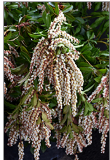
Pieris, Mountain Fire Japanese flowers