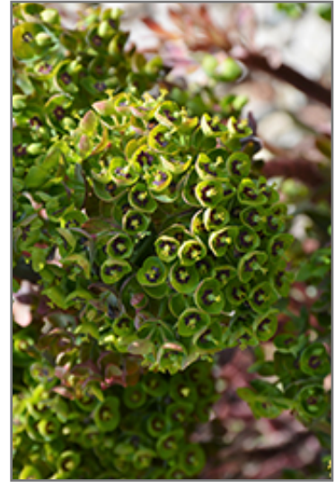
Tiny Tim Euphorbia flowers

Tiny Tim Euphorbia is a fine choice for the garden, but it is also a good selection for planting in outdoor pots and containers. It is often used as a 'filler' in the 'spiller-thriller-filler' container combination, providing a mass of flowers against which the thriller plants stand out. Note that when growing plants in outdoor containers and baskets, they may require more frequent waterings than they would in the yard or garden.