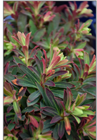
Tiny Tim Euphorbia flowers