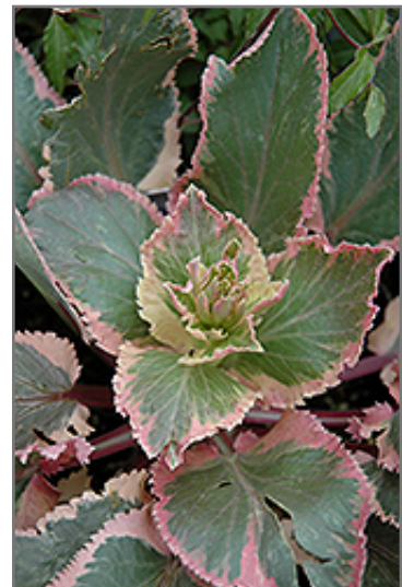
Jade Frost Variegated Sea Holly foliage