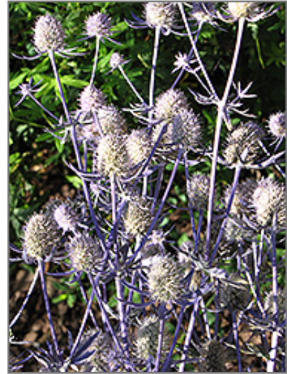
Jade Frost Variegated Sea Holly flowers

Jade Frost Variegated Sea Holly will grow to be about 8 inches tall at maturity extending to 24 inches tall with the flowers, with a spread of 15 inches. When grown in masses or used as a bedding plant, individual plants should be spaced approximately 12 inches apart. Its foliage tends to remain low and dense right to the ground. It grows at a medium rate, and under ideal conditions can be expected to live for approximately 10 years. As an herbaceous perennial, this plant will usually die back to the crown each winter, and will regrow from the base each spring. Be careful not to disturb the crown in late winter when it may not be readily seen!