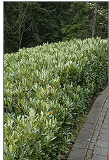
Laurel, Cherry Otto Luyken in bloom