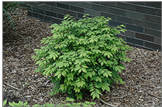
Burning Bush, Little Moses