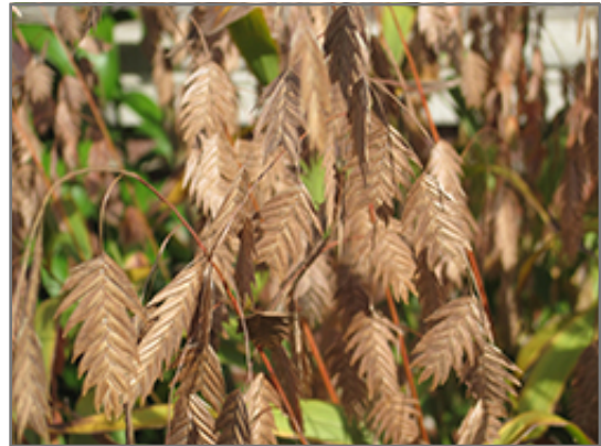
Northern Sea Oat Grass fruit

Northern Sea Oat Grass will grow to be about 4 feet tall at maturity, with a spread of 30 inches. Its foliage tends to remain dense right to the ground, not requiring facer plants in front. It grows at a medium rate, and under ideal conditions can be expected to live for approximately 10 years. As an herbaceous perennial, this plant will usually die back to the crown each winter, and will regrow from the base each spring. Be careful not to disturb the crown in late winter when it may not be readily seen!