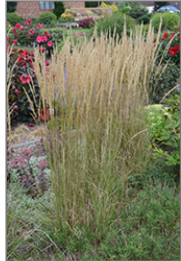
El Dorado Feather Reed Grass

El Dorado Feather Reed Grass is recommended for the following landscape applications;