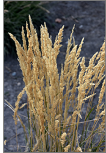
El Dorado Feather Reed Grass fruit

El Dorado Feather Reed Grass is a fine choice for the garden, but it is also a good selection for planting in outdoor pots and containers. Because of its height, it is often used as a 'thriller' in the 'spiller-thriller-filler' container combination; plant it near the center of the pot, surrounded by smaller plants and those that spill over the edges. It is even sizeable enough that it can be grown alone in a suitable container. Note that when growing plants in outdoor containers and baskets, they may require more frequent waterings than they would in the yard or garden.