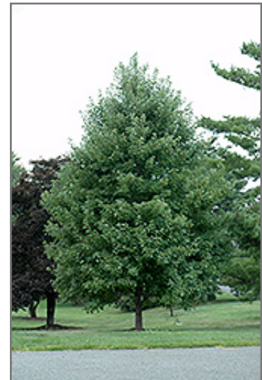
Maple, (Red) October Glory