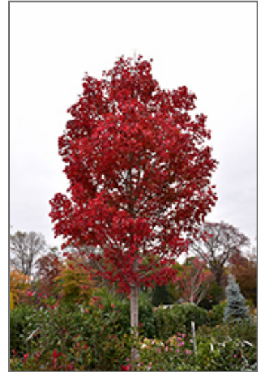
Maple, (Red) October Glory in fall