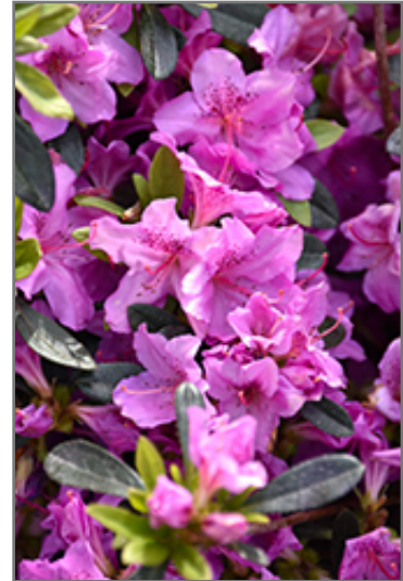
Karen Azalea flowers

Karen Azalea will grow to be about 3 feet tall at maturity, with a spread of 4 feet. It tends to be a little leggy, with a typical clearance of 1 foot from the ground. It grows at a slow rate, and under ideal conditions can be expected to live for 40 years or more.