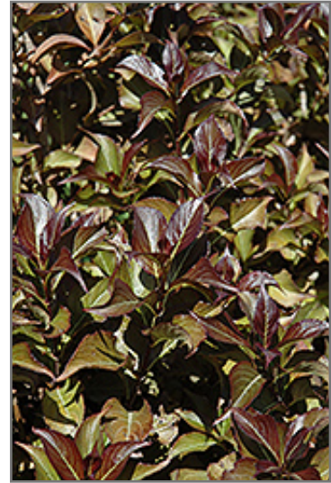
Weigela, Dark Horse foliage

Weigela, Dark Horse makes a fine choice for the outdoor landscape, but it is also well-suited for use in outdoor pots and containers. Because of its height, it is often used as a 'thriller' in the 'spiller-thriller-filler' container combination; plant it near the center of the pot, surrounded by smaller plants and those that spill over the edges. It is even sizeable enough that it can be grown alone in a suitable container. Note that when grown in a container, it may not perform exactly as indicated on the tag - this is to be expected. Also note that when growing plants in outdoor containers and baskets, they may require more frequent waterings than they would in the yard or garden.