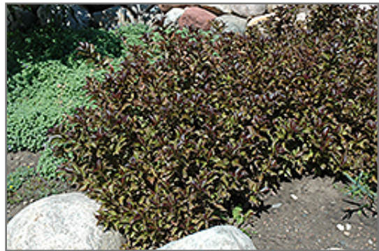
Weigela, Dark Horse