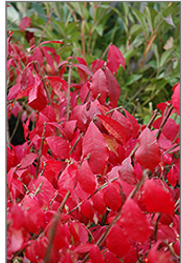
Burning Bush, Compact (tree form) in fall