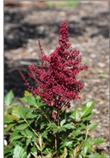
Astilbe, Red Sentinel flowers

Astilbe, Red Sentinel is a fine choice for the garden, but it is also a good selection for planting in outdoor pots and containers. With its upright habit of growth, it is best suited for use as a 'thriller' in the 'spiller-thriller-filler' container combination; plant it near the center of the pot, surrounded by smaller plants and those that spill over the edges. Note that when growing plants in outdoor containers and baskets, they may require more frequent waterings than they would in the yard or garden.