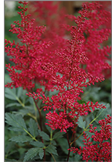
Astilbe, Red Sentinel flowers

Astilbe, Red Sentinel is recommended for the following landscape applications;