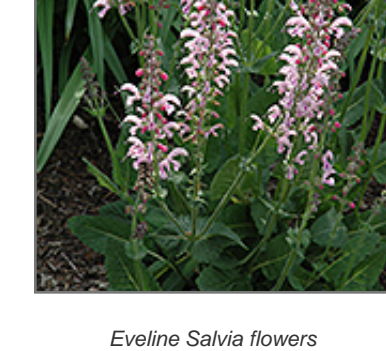
Eveline Salvia flowers