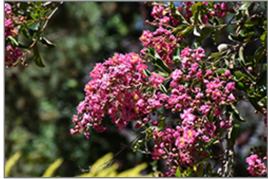
Crape Myrtle, Pecos flowers

Crape Myrtle, Pecos will grow to be about 8 feet tall at maturity, with a spread of 6 feet. It has a low canopy with a typical clearance of 1 foot from the ground, and is suitable for planting under power lines. It grows at a medium rate, and under ideal conditions can be expected to live for approximately 20 years.