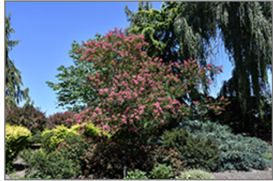
Crape Myrtle, Pecos in bloom

Crape Myrtle, Pecos is recommended for the following landscape applications;