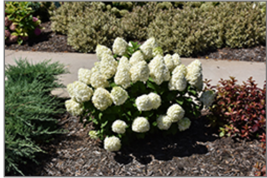
Hydrangea, Little Lime Punch in bloom

Hydrangea, Little Lime Punch makes a fine choice for the outdoor landscape, but it is also well-suited for use in outdoor pots and containers. With its upright habit of growth, it is best suited for use as a 'thriller' in the 'spiller-thriller-filler' container combination; plant it near the center of the pot, surrounded by smaller plants and those that spill over the edges. It is even sizeable enough that it can be grown alone in a suitable container. Note that when grown in a container, it may not perform exactly as indicated on the tag - this is to be expected. Also note that when growing plants in outdoor containers and baskets, they may require more frequent waterings than they would in the yard or garden.