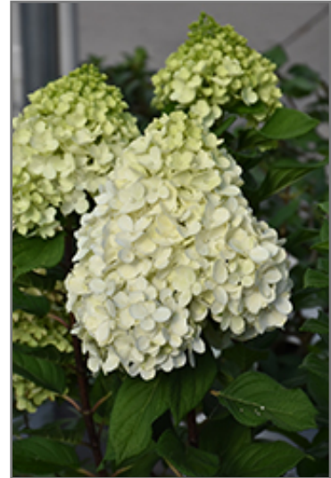
Hydrangea, Little Lime Punch flowers