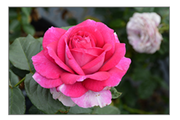
Rose (Hybrid Tea), Perfume Factory flowers