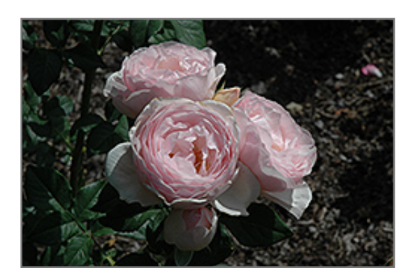
Rose (Hybrid Tea), Earth Angel flowers