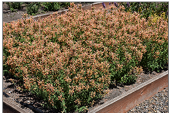
Kudos Gold Hummingbird Mint in bloom