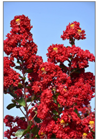
Crape Myrtle, Double Dynamite flowers