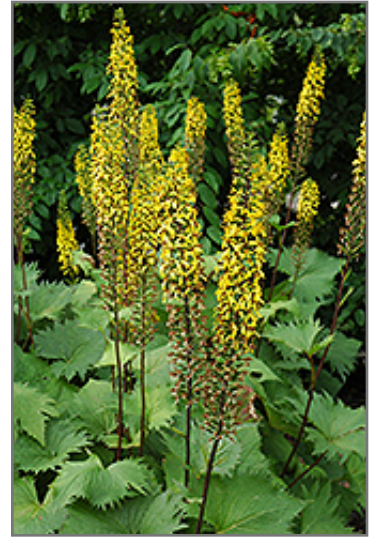
The Rocket Ligularia flowers