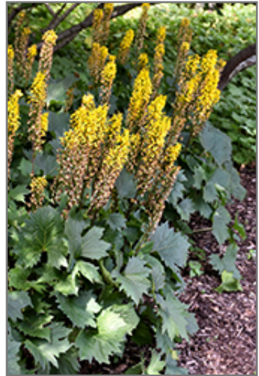
The Rocket Ligularia in bloom