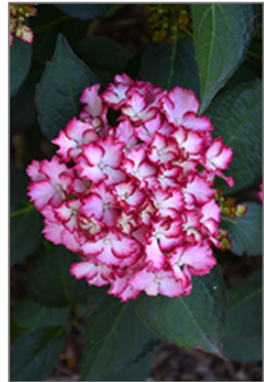
Hydrangea, Fire Island flowers