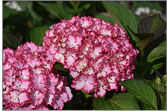
Hydrangea, Fire Island flowers

Hydrangea, Fire Island is recommended for the following landscape applications;