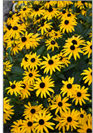
American Gold Rush Black Eyed Susan flowers

This is a relatively low maintenance plant, and should be cut back in late fall in preparation for winter. It is a good choice for attracting birds, bees and butterflies to your yard, but is not particularly attractive to deer who tend to leave it alone in favor of tastier treats. It has no significant negative characteristics.