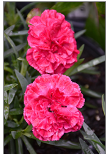
Fruit Punch Raspberry Ruffles Dianthus flowers